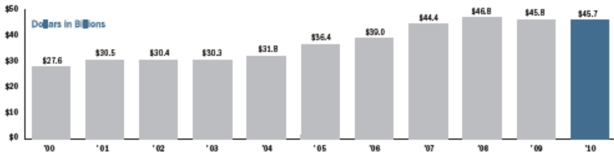
Source: The Foundation Center, Foundation Growth and Giving Estimates, 2011 . All figures based on unadjusted dollars. Figure estimated for 2010.

U.S. foundation asset growth. The first historical chart is shown in billions of constant 1975 dollars to provide an accurate graph. The second is unadjusted and shows the impact of the 2007-08 financial crisis. At this writing (April, 2011) many large foundations have recovered but the future is uncertain.